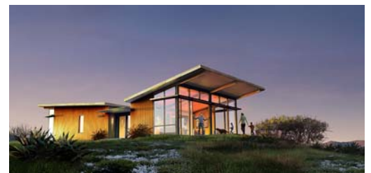
*model sd121 shown

Visit our website for more details, and a downloadable Spec Package & Options Sheet.